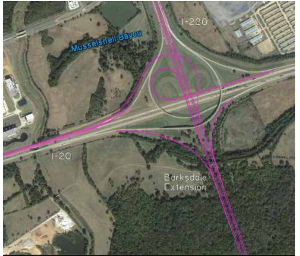
Aerial view of Sen. Ryan Gatti’s No. 1 priority — the Barksdale Extension for I-220

Construction should start by the end of the summer.