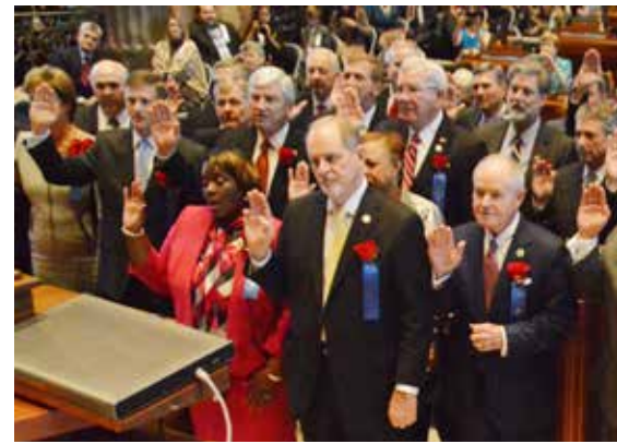
Members of the Louisiana Senate being sworn in.