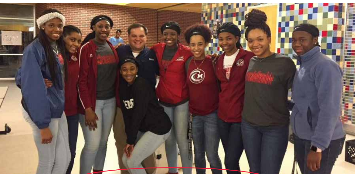
SEN. RYAN GATTI with Minden High ladies basketball team

Citizens and legislators working together are needed to curb wasteful spending.