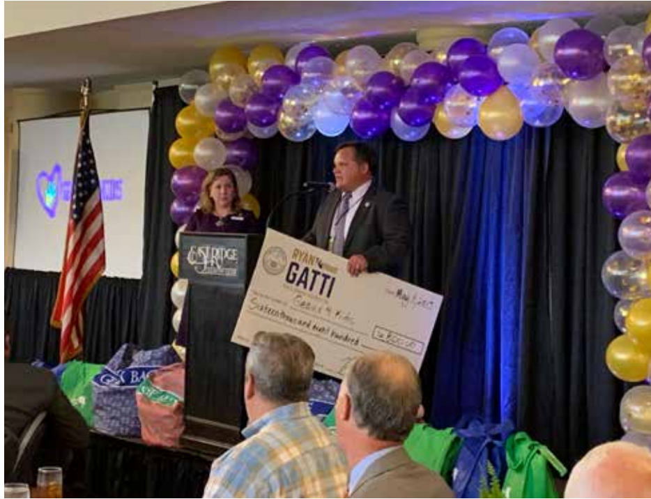
Sen. Ryan Gatti presented a check for $16,800 to Geaux 4 Kids last year.

The Ringgold Food Pantry is a branch of the Food Pantry of Northwest Louisiana, whose mission is to be the primary resource for fighting hunger in Northwest Louisiana. It aims to ultimately end hunger in the area by maintaining a consolidated network of effective food collection and dis-