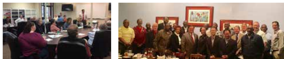
Scenes from some of Sen. Ryan Gatti's 50 town hall meetings across District 36