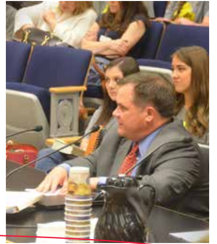
SEN. RYAN GATTI with new Webster registrar XXX and retiring register XXX; XXX; and Sen. Gatti in committee