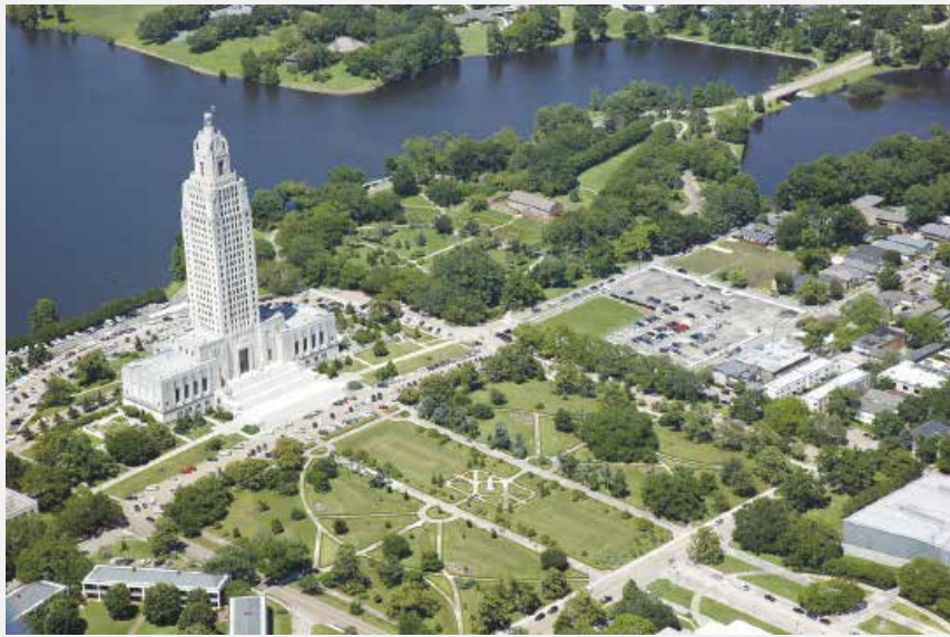
Real Leadership at State Capitol