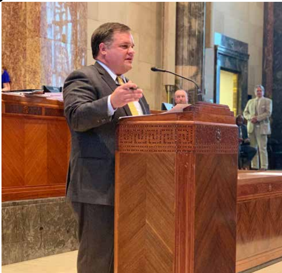
SEN. RYAN GATTI addresses the Louisiana State Senate.

After 50 Town Halls, Sen. Gatti Says It's No Secret Where District 36 Stands