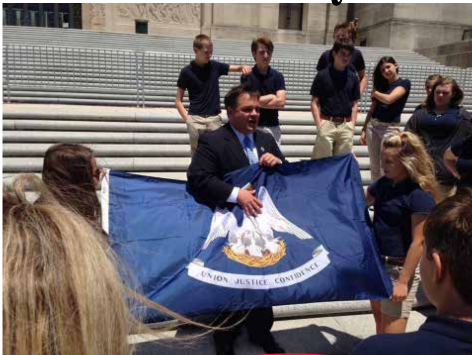
SEN. RYAN GATTI speaks to students from XXXX High School visiting the State Capitol. Since 2016, Sen. Gatti has visited all 37 public schools in Senate District 36.

This area must be left blank for mailing indicia and recipient's address