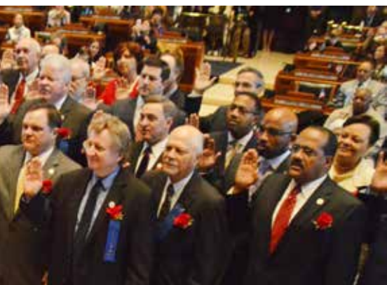
... during organizational session in January 2016

from Northwest Louisiana testified in favor of school faculty members and staff to pray with students. The measure passed the legislature and was signed into law.