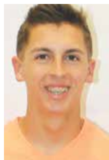
Micah Barnett Sports Medicine Award