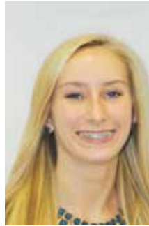
London Perrault Academic Excellence