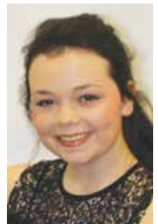
Reagan Gill Excellence in Art Award