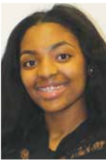
Victoria Savage Sports/ Entertainment Marketing