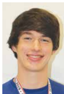
Kade Kepper Chemistry Award