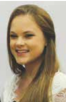
Taylor Parker Guitar Award