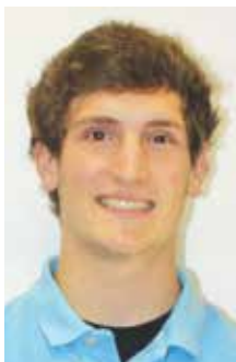
Shane Smith Gardner Scholarship