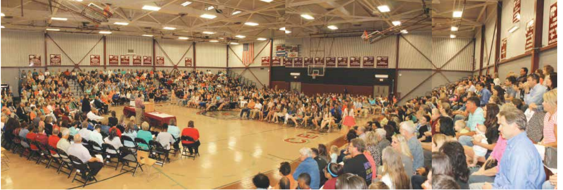
CENTRAL HIGH SCHOOL AWARDS PROGRAM drew a packed crowd to the Wildcat gym on the evening of April 28.