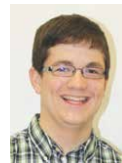
Parker Wales Music Tec