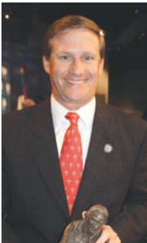
Sen. Barrow Peacock