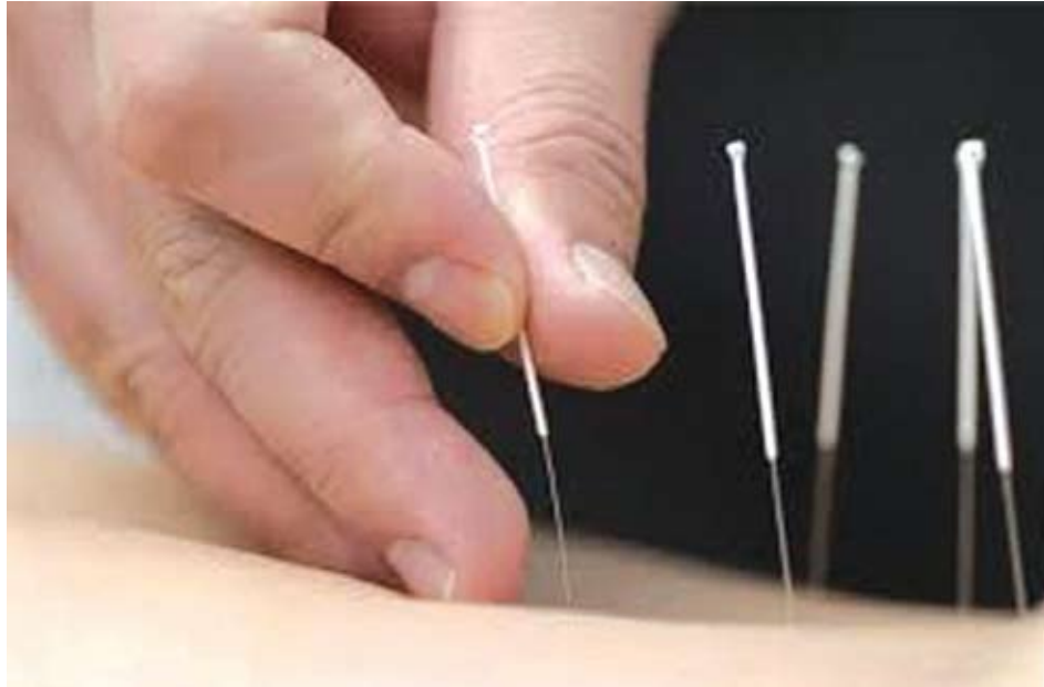
Moreau Physical Therapy is now offering Trigger Point Dry Needling

When the nerves are irritated, they cause a protective spasm of all the muscles to which they are connected. This may cause peripheral diagnoses such as carpal tunnel, tendonitis, osteoarthritis, decreased mobility and chronic pain. Small, thin needles are inserted into painful areas of muscles known as trigger points. Skilled movement of the needle elicits relaxation and pain