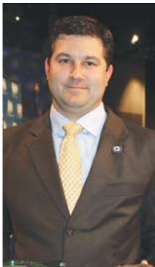
Sen. Rick Ward III