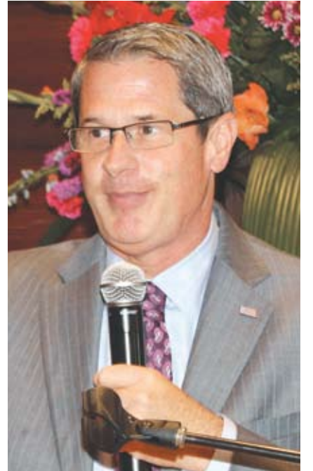
Sen. David Vitter