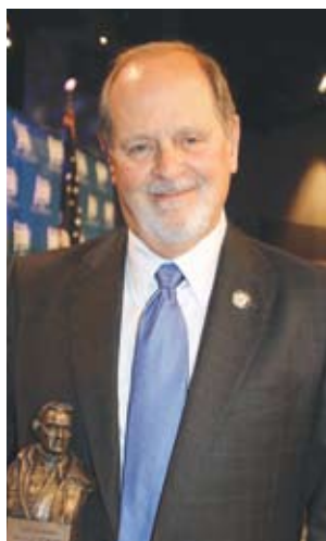
Sen. Jack Donahue