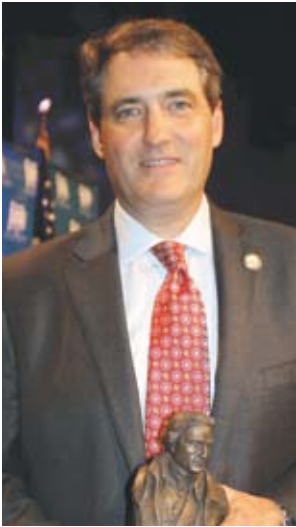
Rep. Hunter Greene