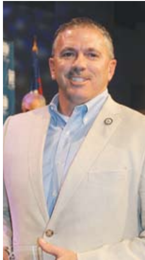
Rep. Clay Schexnayder