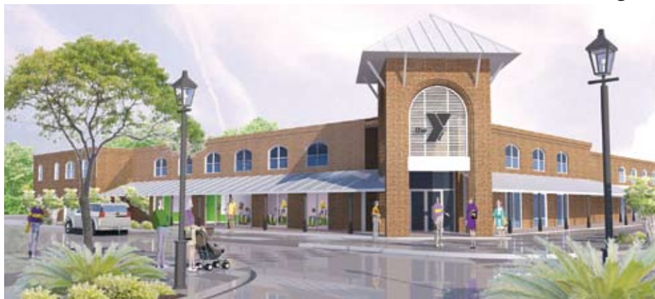
Rendering of new YMCA to be built in Zachary

The New Market Tax Credit Program was established by Congress in 2000 to help stimulate economic growth, support job creation, and foster small business growth in un-