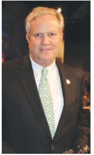
Sen. Conrad Appel