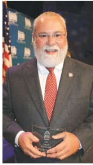
Sen. Bret Allain II