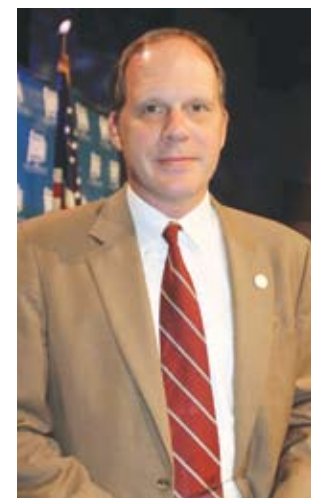
Rep. Franklin Foil