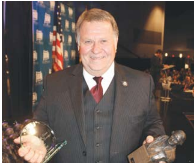
Sen. A.G. Crowe