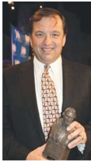
Rep. Tim Burns