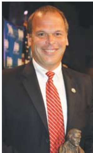
Rep. Erich Ponti